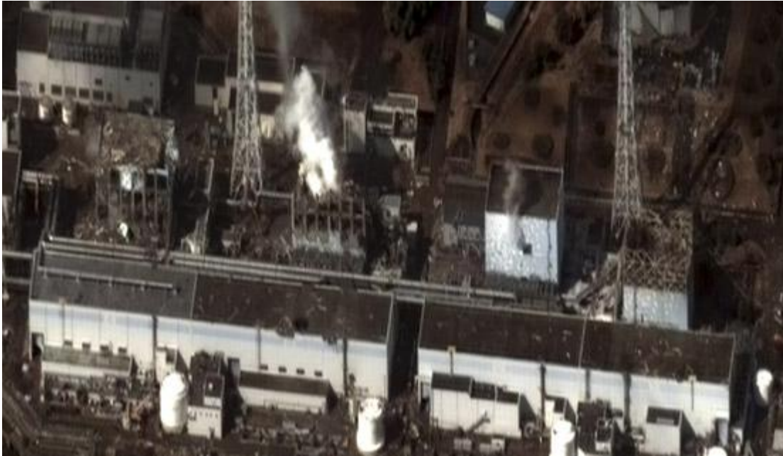
Photo of the Fukushima Daiichi plant, Units 1-4 (from right to left) of 16-03-2011

The fuel assemblies in the fuel pool are presumably damaged. According to JAIF (12:30 h), the reactor building is also damaged. The fuel pool is to be injected with the help of fire fighting equipment (fire engine).